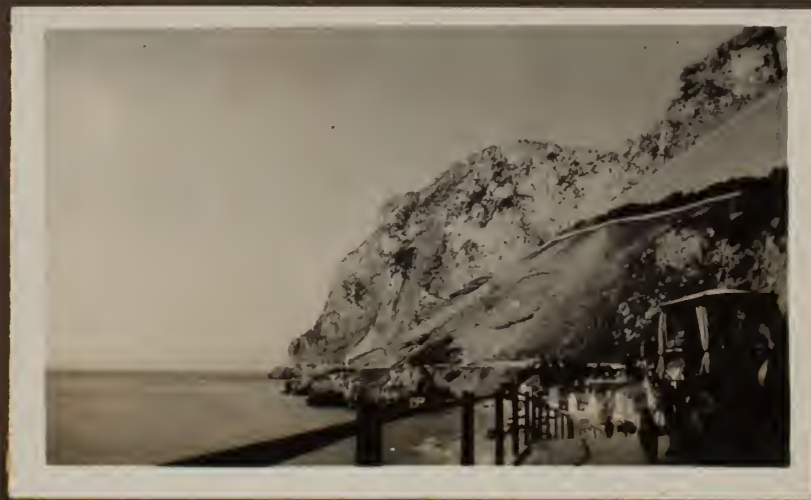
Gibraltár 30. 8. 28.